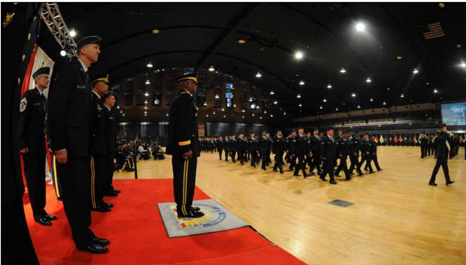
113th Wing members march in formation past D.C. National Guard leadership as part of Pass and Review during the 2015 D.C. National Guard Awards and Decorations Ceremony at the D.C. Armory Dec. 6.