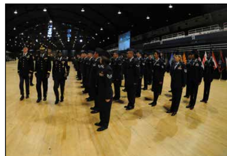
D.C. National Guard leadership inspects a format as part of Pass and Review during the 2015 D.C. National Guard Awards and Decorations Ceremony at the D.C. Armory Dec. 6.