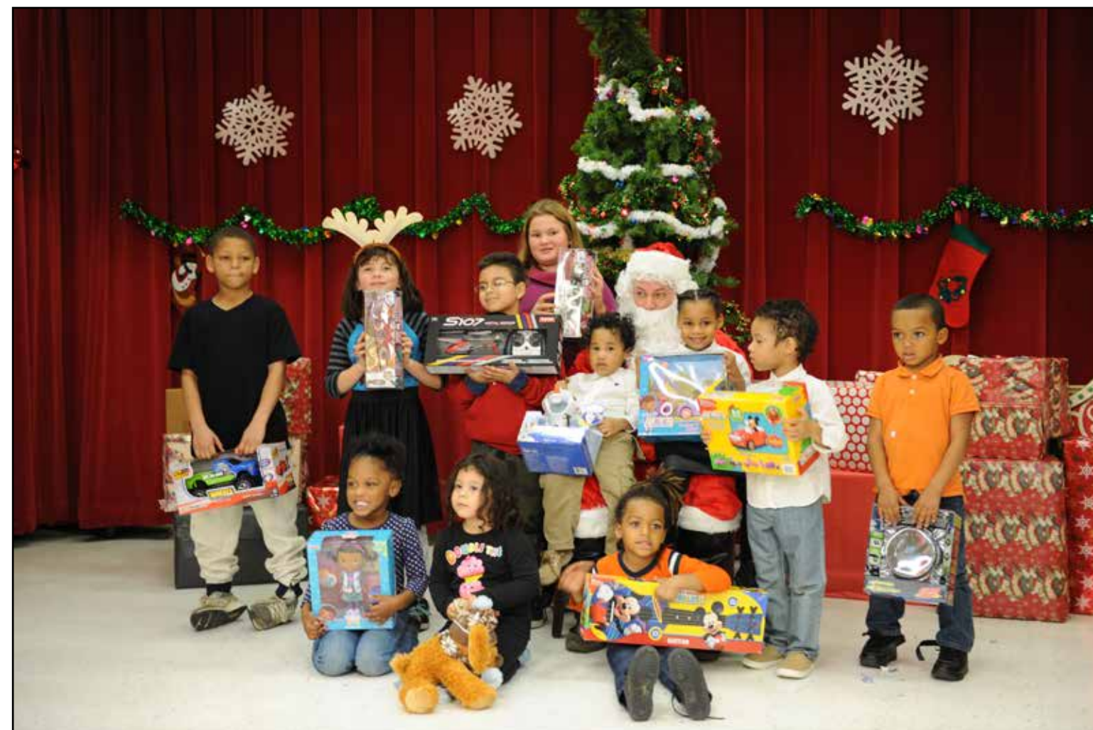
Children from J.P. Ryon Elementary School sit with Santa after receiving presents during the Project Angel Tree event Dec. 15. Members from the 113th Wing donated gifts or funds in support of the event to help community family members during the holiday season.

Photos and Story by Senior Airman Erica Rodriguez 113th Wing Public Affairs