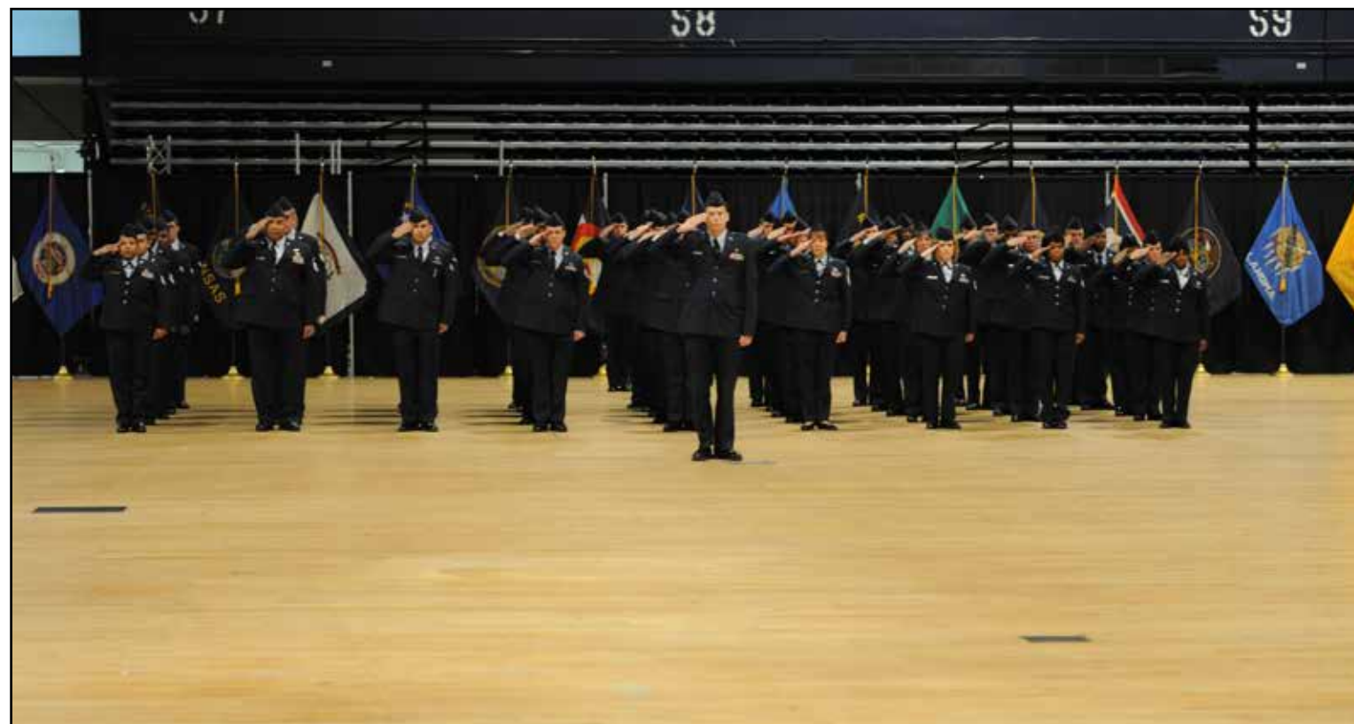
113th Wing members salute in formation during the 2015 D.C. National Guard Awards and Decorations Ceremony at the D.C. Armory Dec. 6.