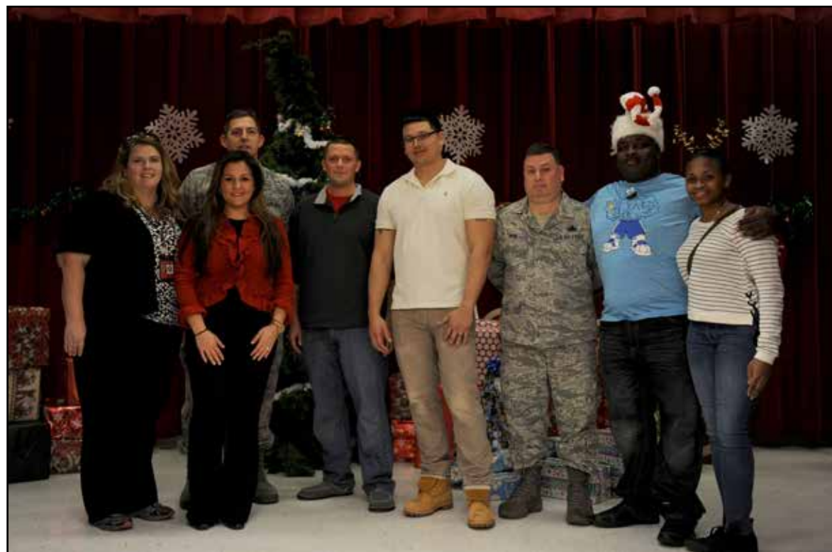
Volunteers from the 113th Wing pose at the Project Angel Tree event at J.P. Ryon Elementary School Dec. 15. Members from the wing raised funds to provide a dinner and gifts to underprivileged families from the school to ensure the community members would have a better holiday season and better relationship with the unit.