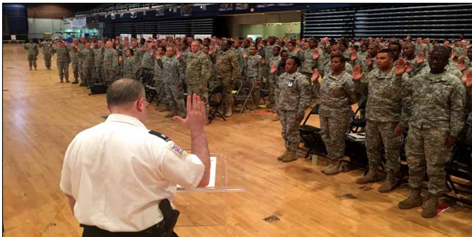
A Washington, D.C. Metropolitan police officer swears in D.C. National Guard members as 'special police' prior to Pope Francis' arrival to D.C. As part of a multi-city tour of the U.S., Pope Francis visited the area Sep. 22 to 24.

The event proved to be another successful domestic op-