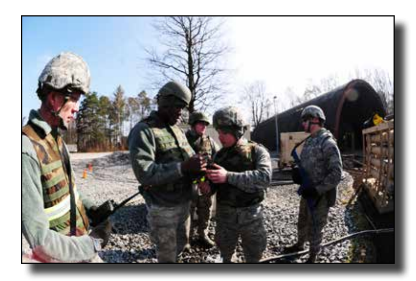
Civil Engineer Water and Fuels Systems maintainers perform checks on filtered water for chlorine or other impurities for the simulated deployment site at Silver Flag in Ramstein Air Base, March 12.