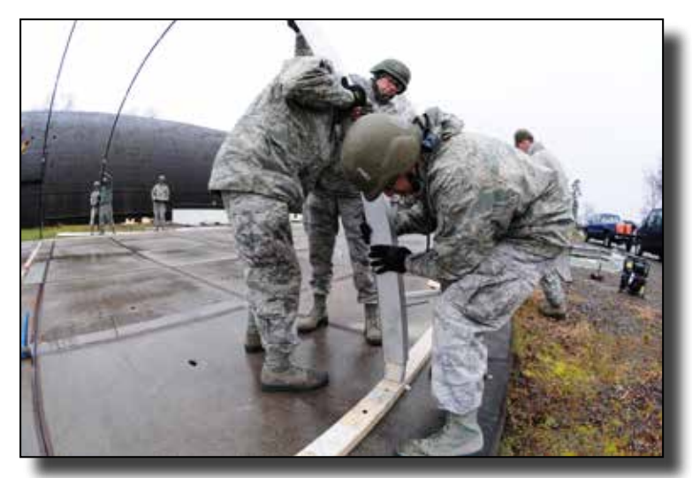
Civil Engineer structures specialists construct field tents during Silver Flag at the field training exercise site on Ramstein Air Base March 6.