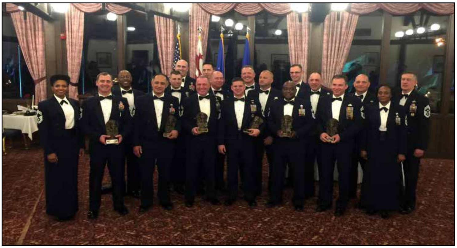
Participants of the D.C. Air National Guard Chief Master Sergeant Recognition Ceremony pose for group photo at the Courses at Andrews, March 26.