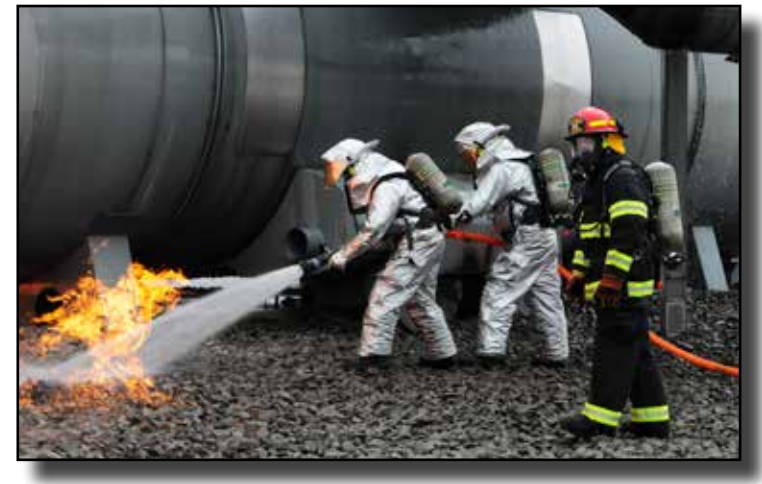
175th Fire and Emergency Services members put out fires at an aircraft trainer during Silver Flag on Ramstein Air Base, March 11.