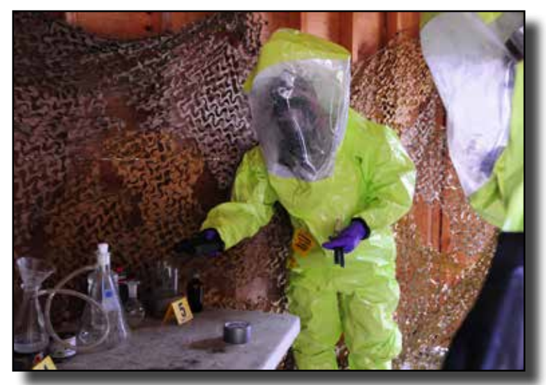
Civil Engineer Emergency Management members suited in hazardous material gear search in a simulated chemical lab, looking for spills and other chemical hot spots to radio back to the incident command post with their findings, March 12.