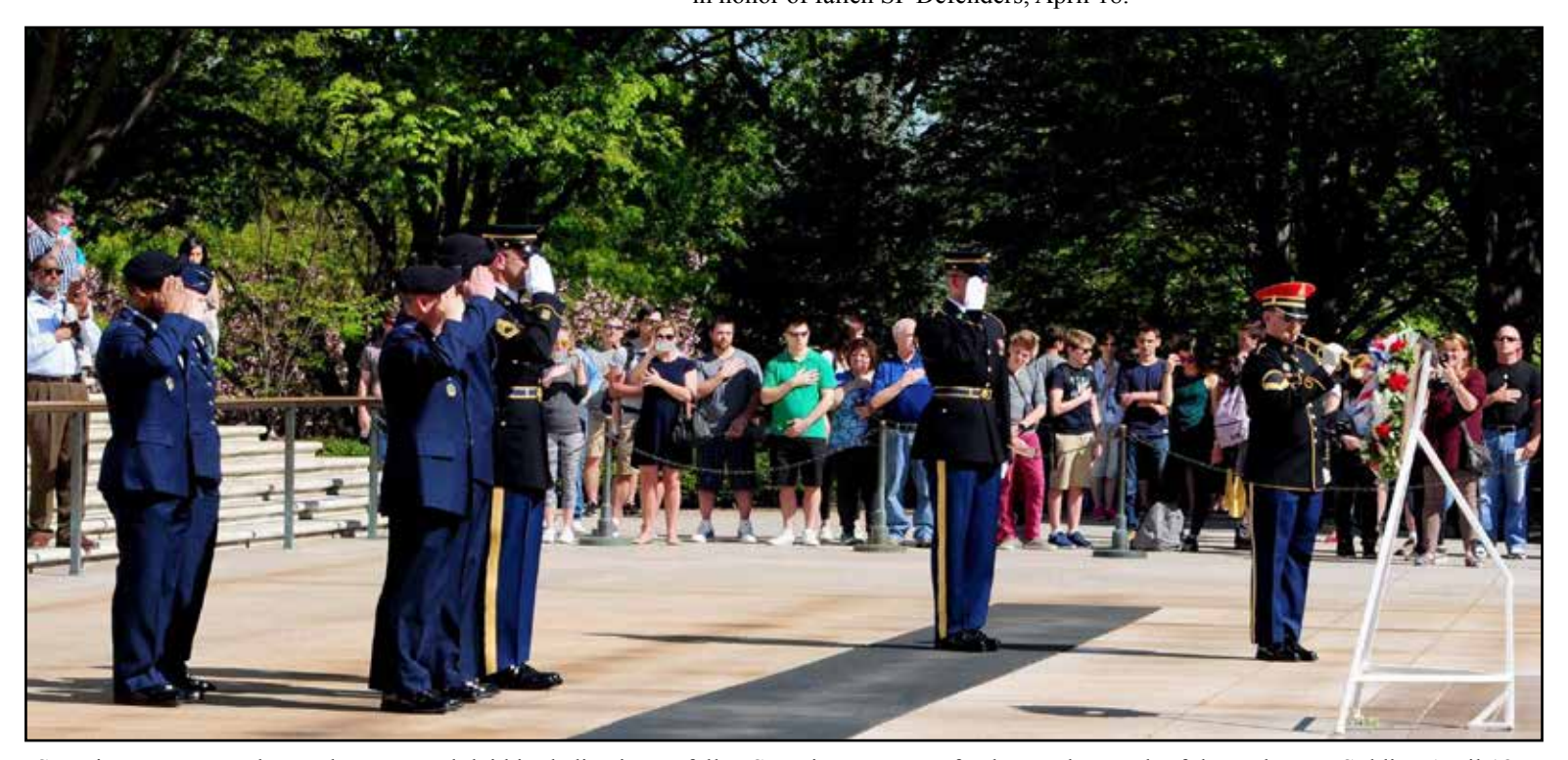
Security Forces members salute a wreath laid in dedication to fallen Security Forces Defenders at the Tomb of the Unknown Soldier, April 18.